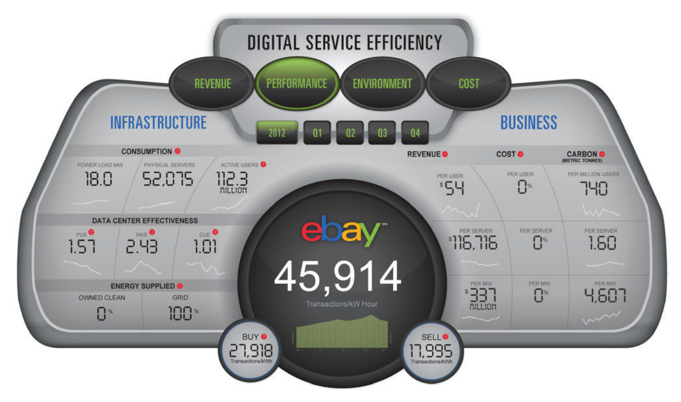
Figure 2. A dashboard can display a company's specific DSE measures over a set of user-selected time periods.

application in a pool of servers, they were able to remove 400 servers from the pool, decreasing nearly a megawatt of power consumption and avoiding over US $2 million in capital to refresh the servers. Performance increased; costs and carbon emissions decreased.